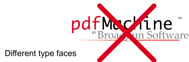
Different type faces

Below are examples of what not to do with the logo.