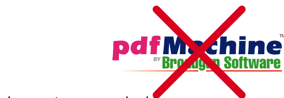
Incorrect or reversed colours